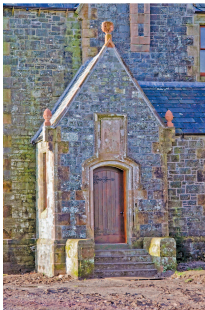
Figure 4. The side foyer has been almost completely restored.

In fact, Maxwell even did considerable research in color blindness. One approach he took was to peer into the eyes of dogs (he loved animals and had a special skill in working with them) and people (who might have been more difficult!) using a homemade ophthalmoscope to explore the causes of color blindness. He also made the world's first color photograph using three negatives with three filters and projected with three projectors. The original negatives, along with many other Maxwell artifacts, are on display