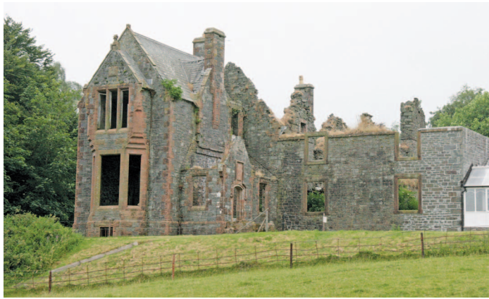
Figure 1. Glenlair as it appeared in July 2005.

Unknown to me until recently was work by a dedicated group in the