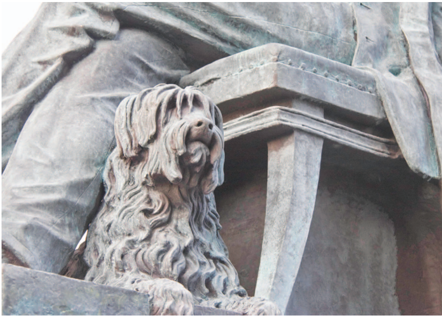
Figure 13. Maxwell's faithful dog at his feet. Note the missing rivets in the chair cushion above the dog's head.

The red light portion of the rainbow is allowed to pass through a small window and into the second prism. Only red light emerges from the second prism. This showed Newton (who is pointing at the ground) that the rainbow of colors is not generated by the prism; rather light is intrinsically composed of these colors and the prism merely separates the colors. To the right, the goddess of red light, Eos