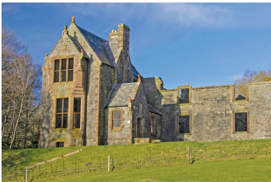
Figure 3. Glenlair nearing the completion of our preservation efforts, November 2008.

floor (Figure 5). The tile floor might have been designed by Maxwell himself. When I first saw the floor in 2005, there was a considerable amount of debris. All I could see was tiles of white, red, green, and blue. With the floor now clean and clear, it turns out there are also two shades of brown, and the red (perhaps with age?) could also be called brown.