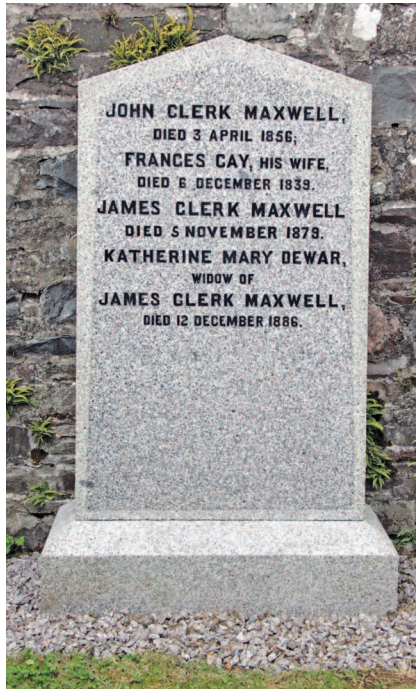
Figure 11. Maxwell’s tombstone with his father and mother listed first and his wife listed last.

Maxwell is sitting, as is customary for philosophers, holding his “color wheel,” the simple apparatus that allowed him to experimentally determine the primary colors of light. It works by varying the percentage of colors in the inner and outer circles until, when the wheel is spun rapidly, the color of each region appears the same. This gives an equation relating the percentages of each color in both regions. Do a few cases, form a set of equations, then find an orthogonal basis that spans the space (modern terminology). The orthogonal basis is red, green, and blue.