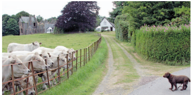
Figure 9. Ferguson's dog greeting cattle, very much as Maxwell would have seen. Glenlair is in the background.