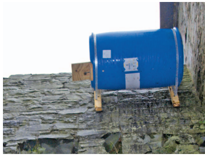
Figure 10. An owl home replacing the previous attic habitat.