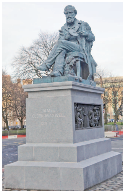
The new statue of Maxwell in Edinburgh.