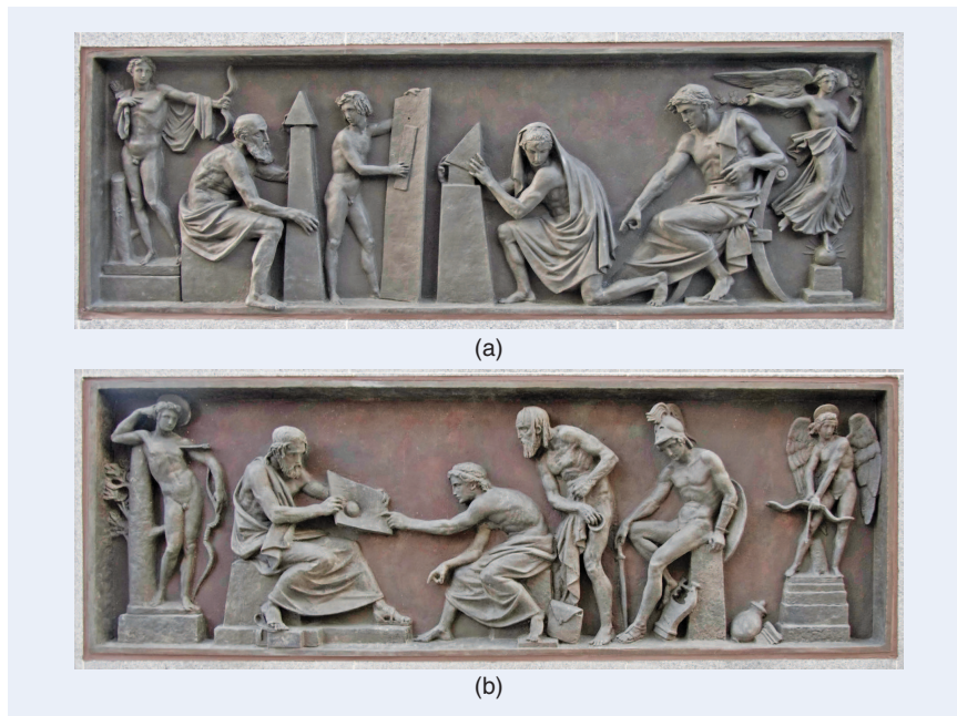
Figure 14. Plinth friezes. (a) Newton's experiments with light and prisms. (b) Einstein holding a rubber-mat model of warped space-time.

forces. To illustrate, a small hand magnet can overcome the force exerted by the entire earth on a small piece of iron. Eros has planted an arrow in Apollo, on the left; gravity can influence light. The naked impoverished philosopher, Diogenes (of "looking for an honest man" fame) here looks on in horror, his begging bowl resembling a failed version of Einstein's model