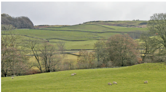
Figure 8. Pastoral view from the front of Glenlair.