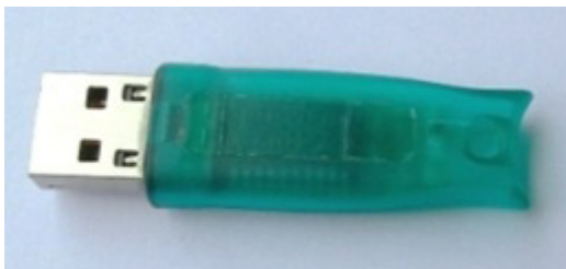
Figure 7-1: Hasp4

HASP4 - HASP4 keys are longer ones - 2 inches (thin).