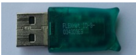
Figure 7-2: HASPHL